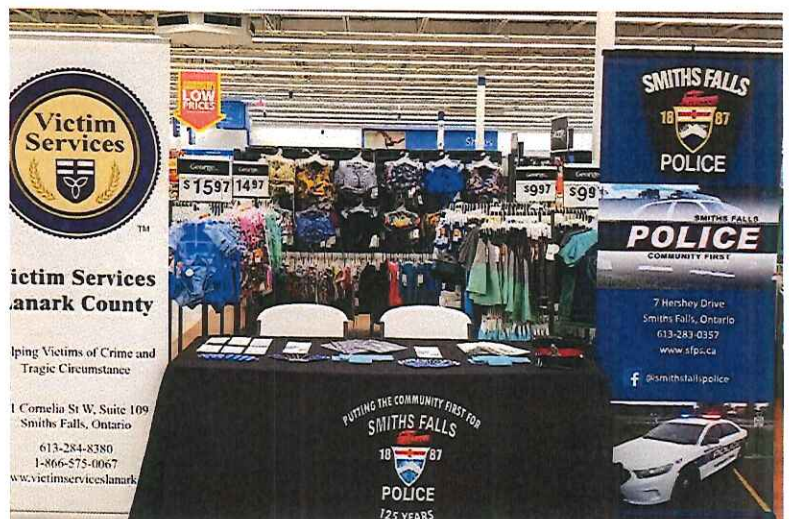
Fraud Awareness with Victim Services