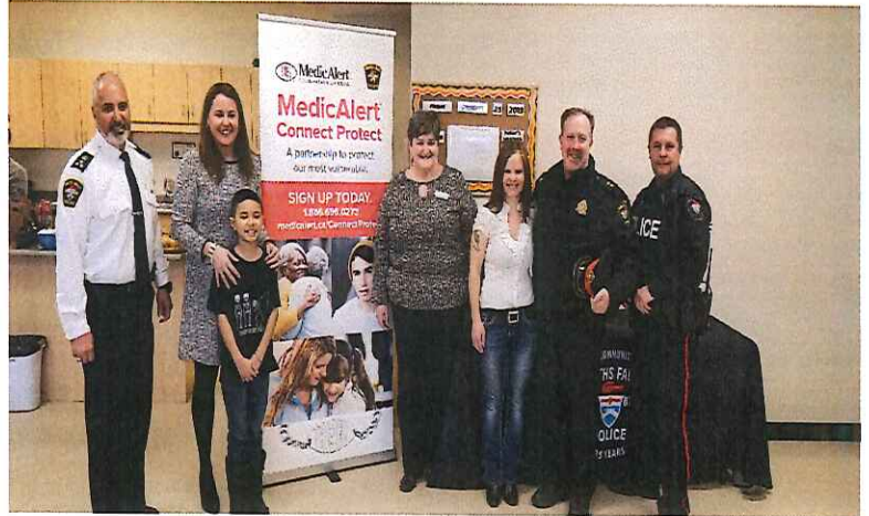
Medic Alert Connect Protect