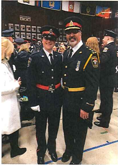
Graduating Police College