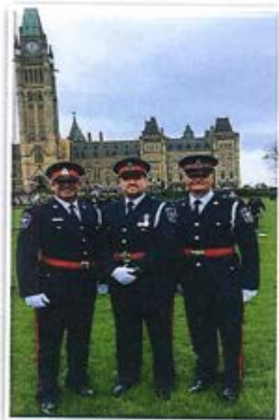
Canadian Police Memorial