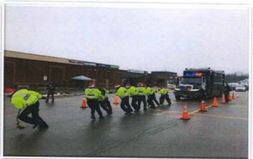
Command Unit Pull for the United Way