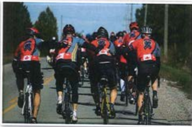
Canadian Police Memorial Ride