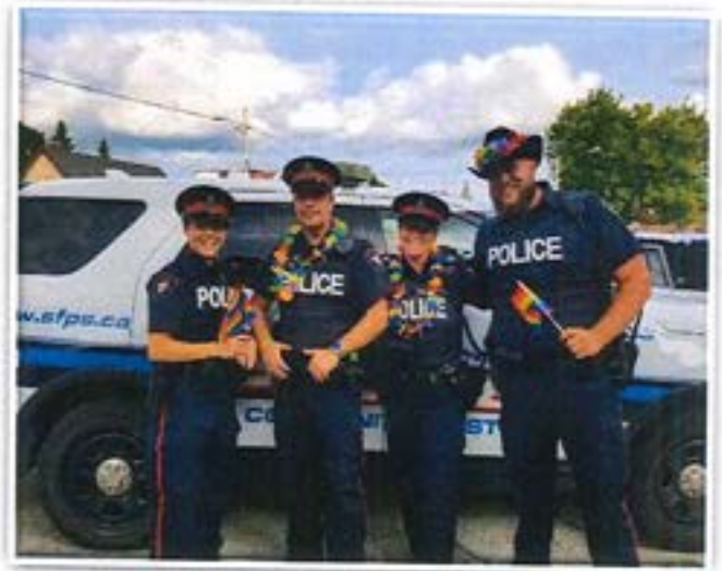
First Pride Parade