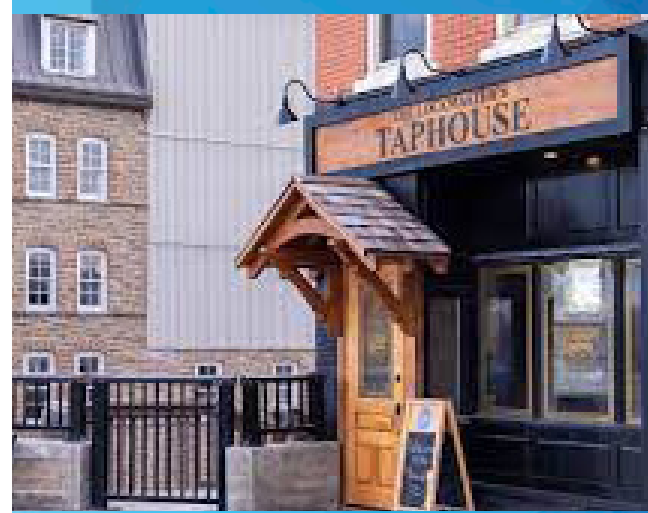
The Lockmaster's TAPHOUSE