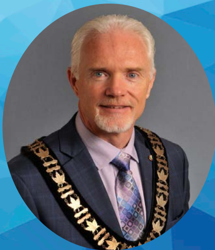
Shawn Pankow Mayor of Smiths Falls