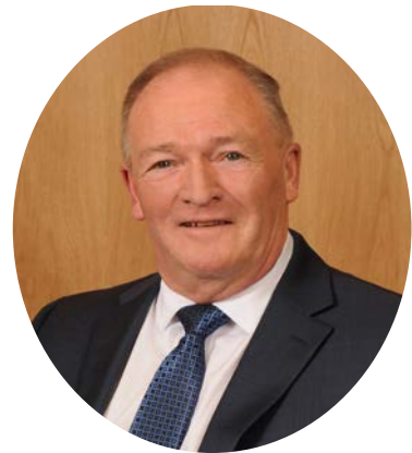
Top row: Mayor Shawn Pankow