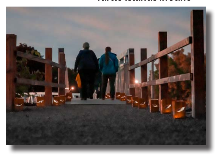
Truth & Reconciliation Cermony September 30th at Sunset, on Duck and Turtle Islands