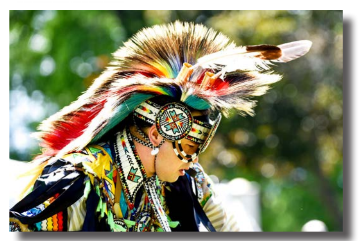
Spirit of the Drum POWWOW