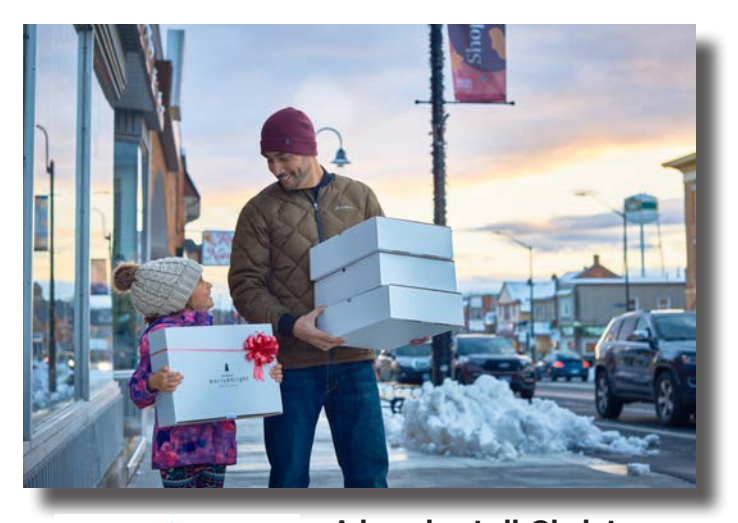
merry & bright