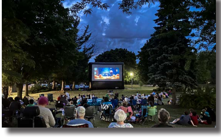
MOVIES UNDER THE STARS