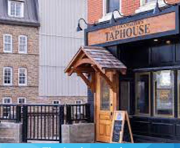
The Lockmaster's TAPHOUSE